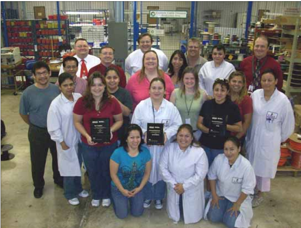
The iRex Custom Cable Team proudly displays the three awards the company received from National Instruments.

The iRex Group, Ltd Custom Cable group had the privilege of being invited to another National Instruments Supplier Appreciation Event. This year, the three day event was hosted in parallel with NI week (a week long event where NI and their partners demonstrate the many applications and ingenuity of NI products). During the event, iRex and NI had a chance to learn more about each others corporate culture and found out that, among other things, Community Citizenship is a discipline shared between the two companies. iRex learned about NI's green initiatives and commitment to future generations and NI learned about the many charities iRex supports, and the TyRex Founded RecognizeGood program. Continued on page 3