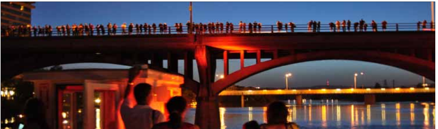
Congress Street Bats watching people on the bridge.